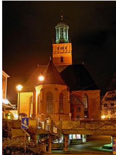
The city Church of Darmstadt

On Monday evening the welcome reception will take place at GSI in KBW foyer directly at the lecture hall.