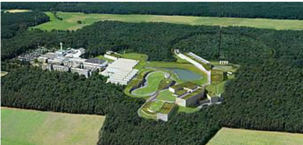
The GSI/FAIR facility