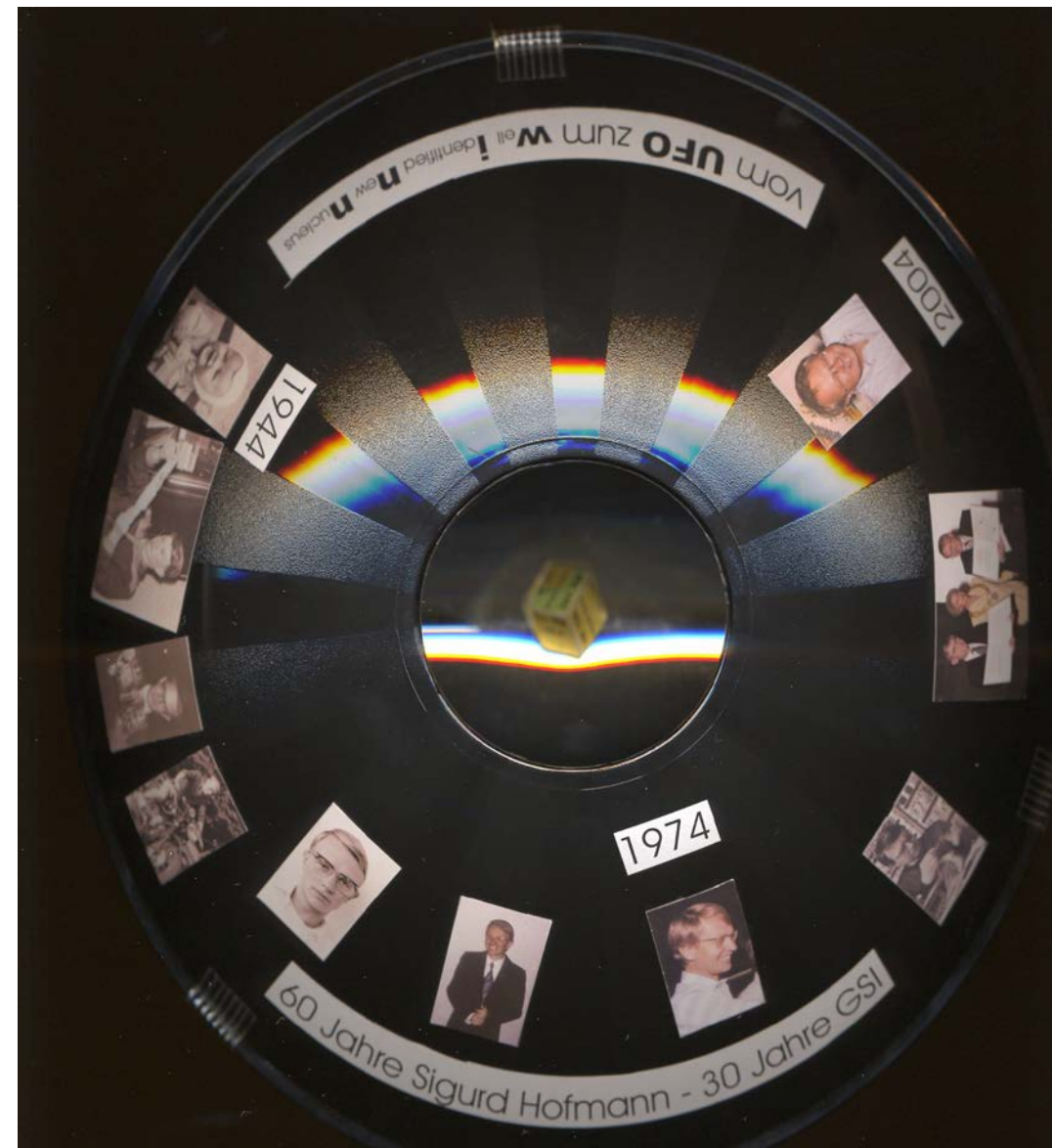
Workshop on the Feature of Superheavy Element Research, February 17 – 18, 2004, GSI Darmstadt, Germany – Part 1