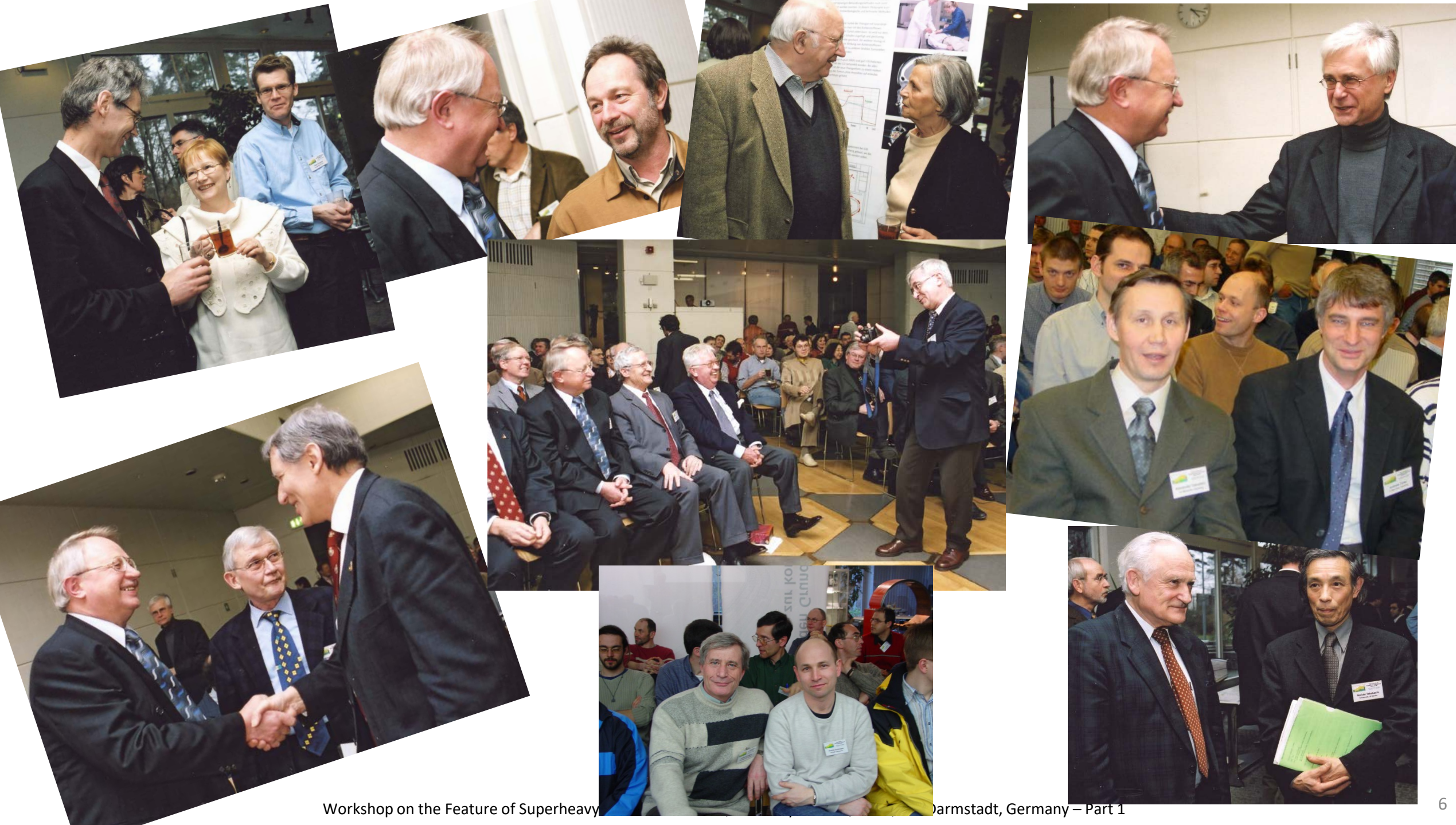
Workshop on the Feature of Superheavy Darmstadt, Germany – Part 1