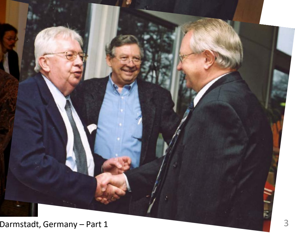
Workshop on the Feature of Superheavy Element Research, February 17 – 18, 2004, GSI Darmstadt, Germany – Part 1