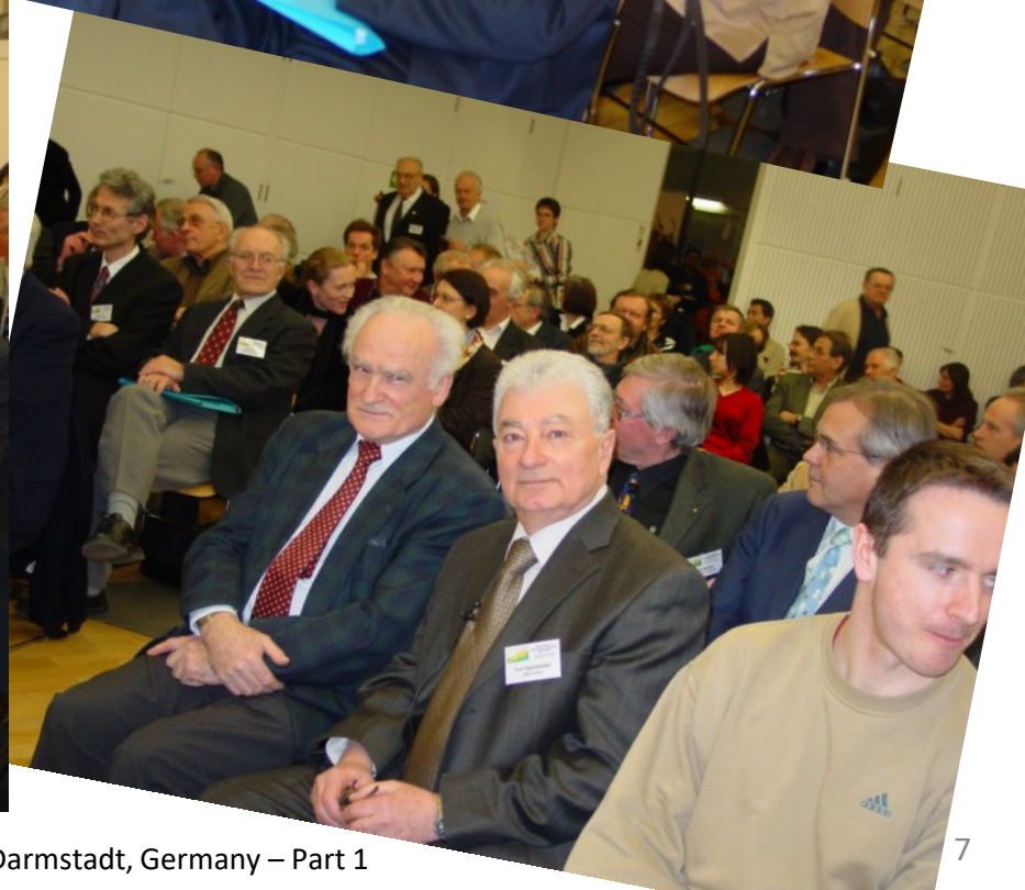
Workshop on the Feature of Superheavy Element Research, February 17 – 18, 2004, GSI Darmstadt, Germany – Part 1