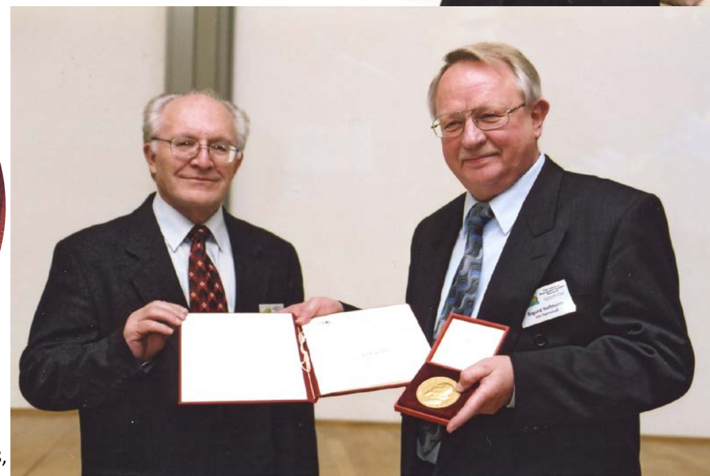
Workshop on the Feature of Superheavy Element Research, February 17 – 18,