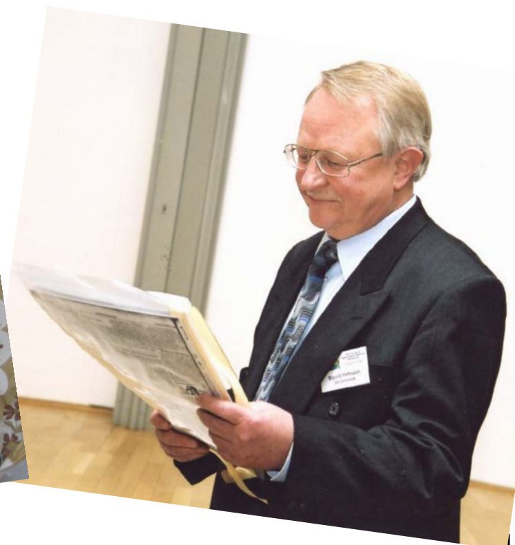
Workshop on the Feature of Superheavy Element Research, February 17 – 18, 2004, GSI Darmstadt, Germany – Part 1