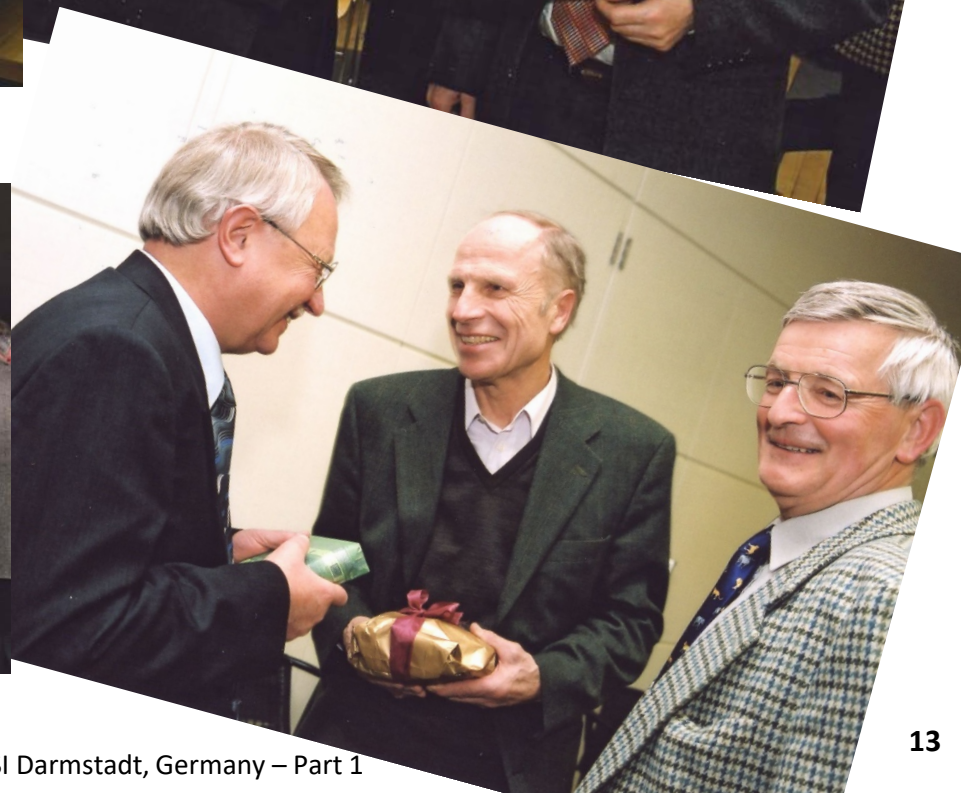
Workshop on the Feature of Superheavy Element Research, February 17 – 18, 2004, GSI Darmstadt, Germany – Part 1