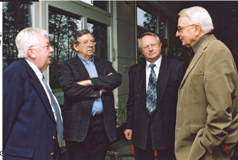
Workshop on the Feature of Superheavy Element Research, February 2004, G