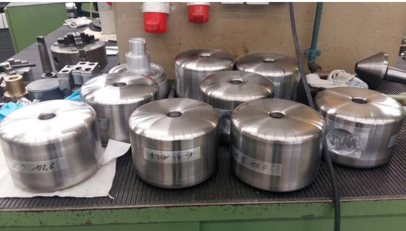
Drift Tubes w/o magnets