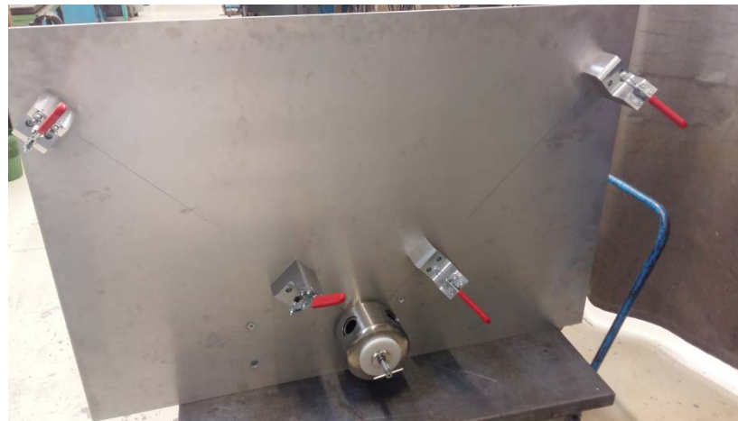
Welding assembly mount