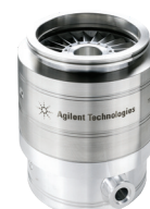
NEW! TwisTorr 704 FS