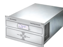
NEW! TwisTorr Medium TMP Controller