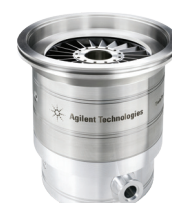
NEW! TwisTorr 804 FS