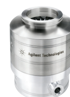
NEW! TwisTorr 404 FS