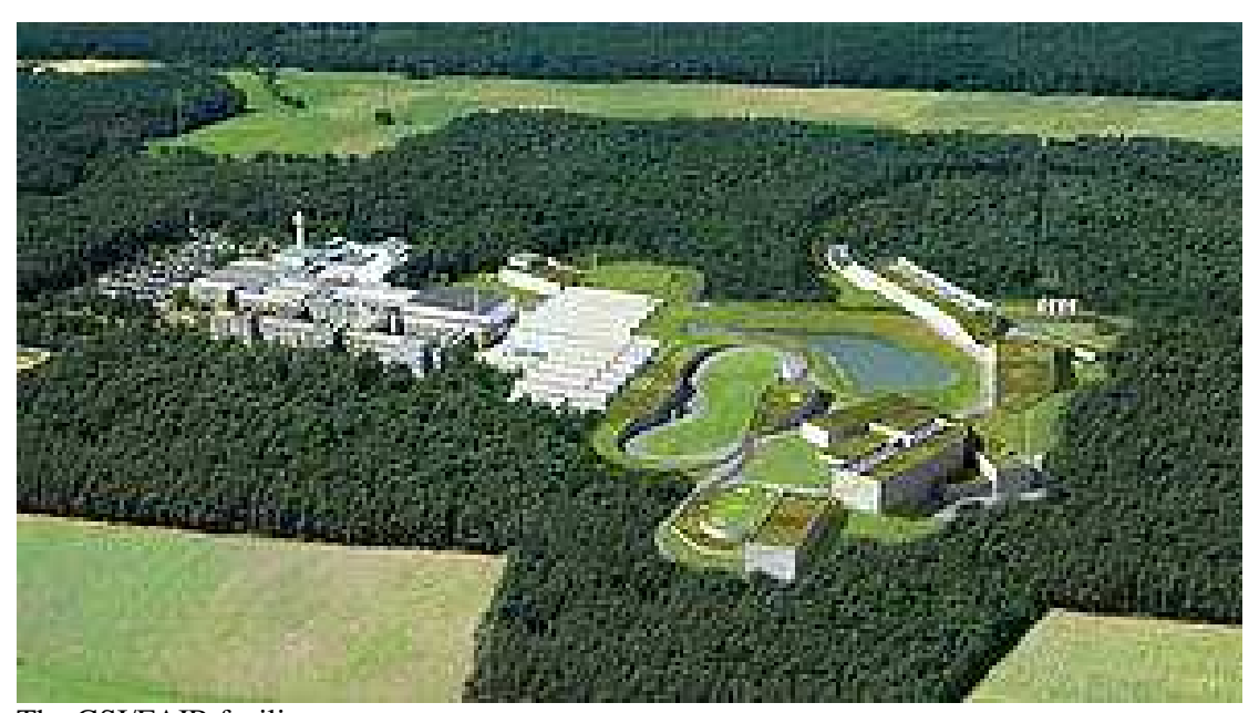
The GSI/FAIR facility

The Workshop will take place at GSI Darmstadt: <a href="https://www.gsi.de/en/start/news.htm">https://www.gsi.de/en/start/news.htm</a>